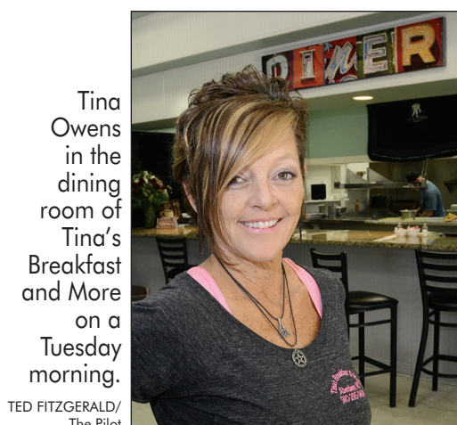
TED FITZGERALD/ The Pilot